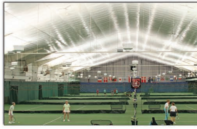
Westwood Racquet Club, PA - 40% SAVINGS