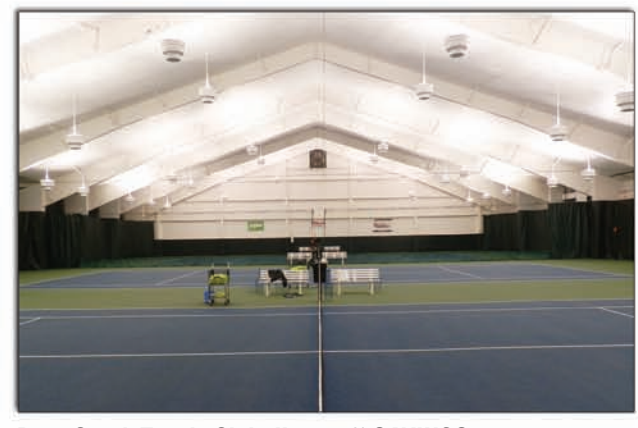
Deer Creek Tennis Club, IL - 37% SAVINGS