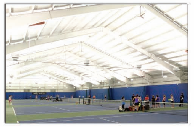
The Sports Club, MI - 43% SAVINGS