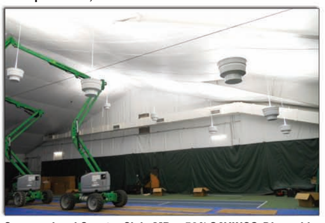
Congressional Country Club, MD - 50% SAVINGS-Dimmable