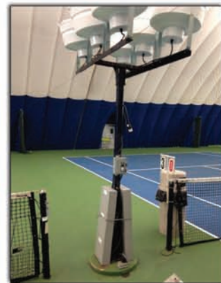
The Sports Club, MI Before — After – 37% SAVINGS