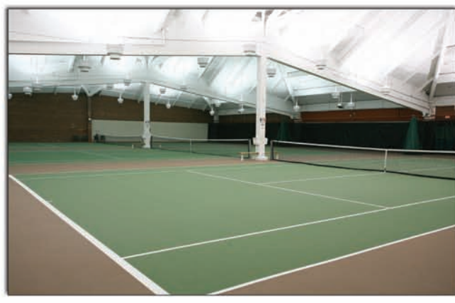
Mountain Park Tennis, OR - 50% SAVINGS-Dimmable