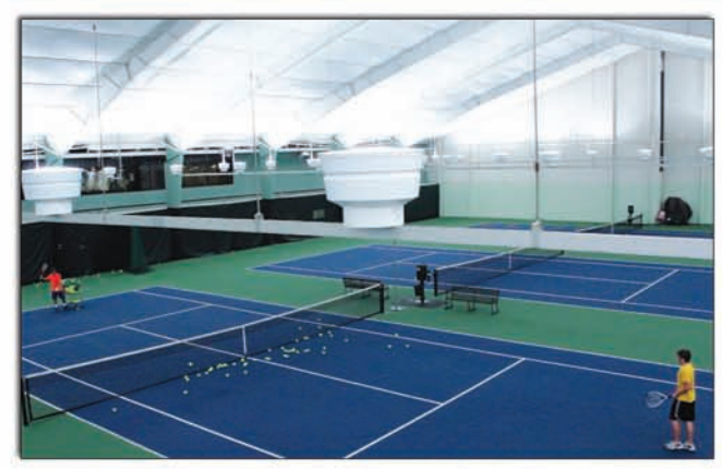
Detroit Tennis & Squash, MI - 37% SAVINGS