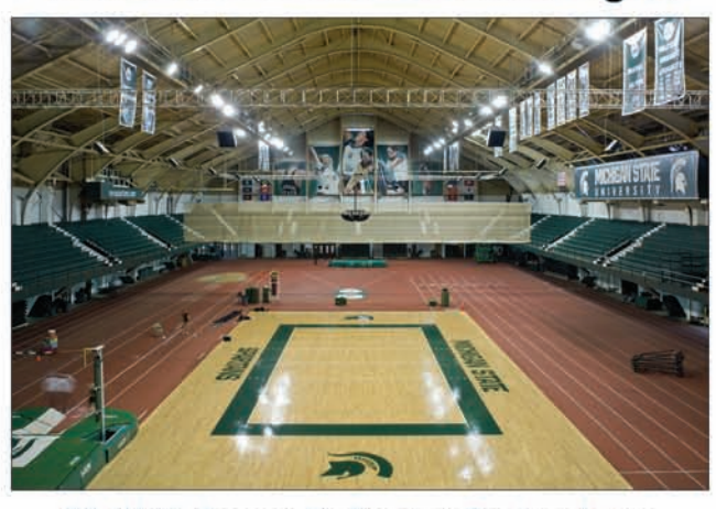
T9 With Super Reflector Technology Direct and Indirect Fixtures