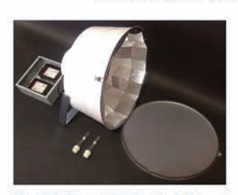
T9-630 Watt MH-XL-Wall Mount